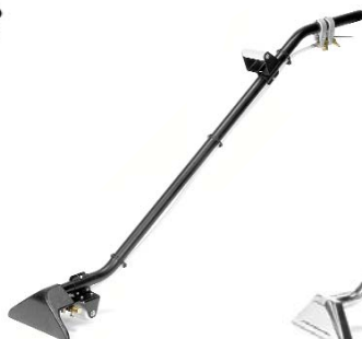
98394 12" Deluxe Drag Wand for 100 PSI or less