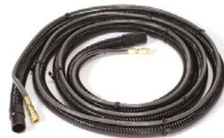
95567 - 20' Vac/Low Pressure Hose for 100 PSI or less or 95568 - 20' Vac/High Pressure Hose for 101 PSI or more