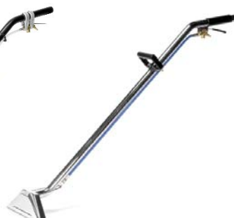
98396 12" Professional Drag Wand for 101 PSI or more