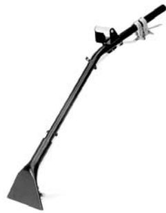
98393 10" Standard Drag Wand for 100 PSI or less